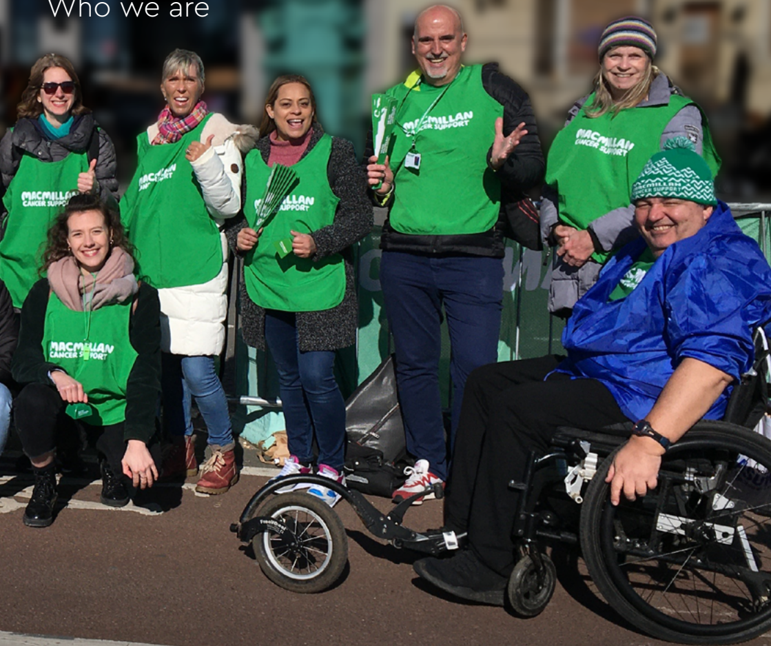
Cheerpoint volunteers at the Brighton Marathon