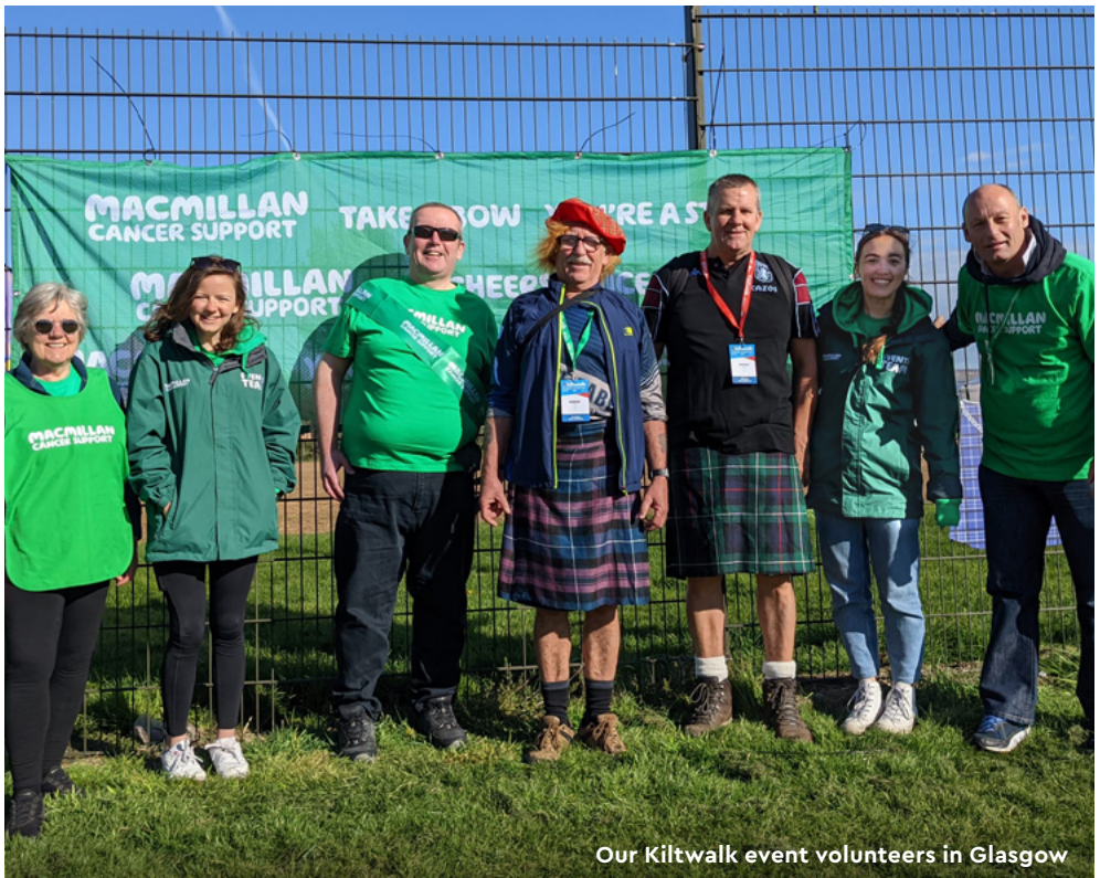
Our Kiltwalk event volunteers in Glasgow