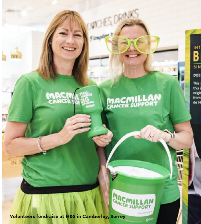
Volunteers fundraising at M&S in Camberley, Surrey