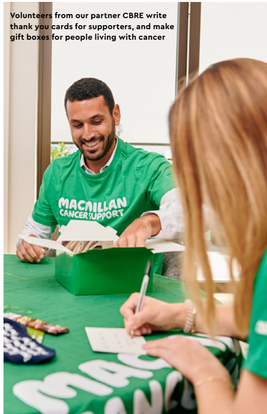
Volunteers from our partner CBRE write thank you cards for supporters, and make gift boxes for people living with cancer