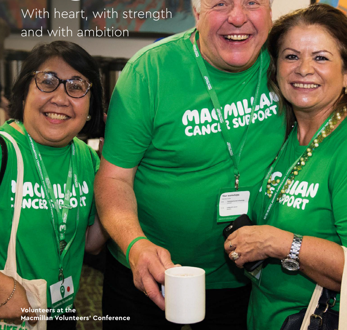
Volunteers at the Macmillan Volunteers' Conference

With heart, with strength and with ambition