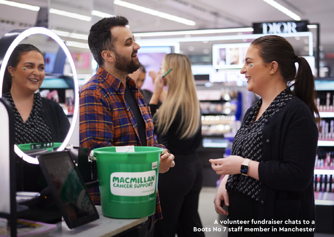
A volunteer fundraiser chats to a Boots No 7 staff member in Manchester