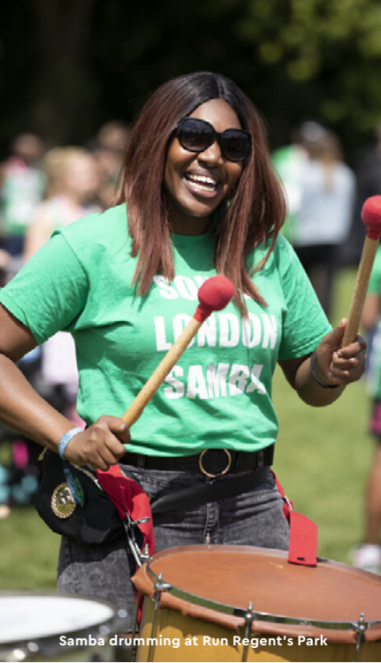
Samba drumming at Run Regent's Park