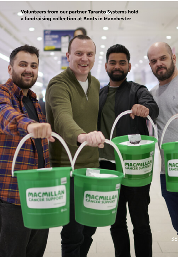
Volunteers from our partner Taranto Systems hold a fundraising collection at Boots in Manchester