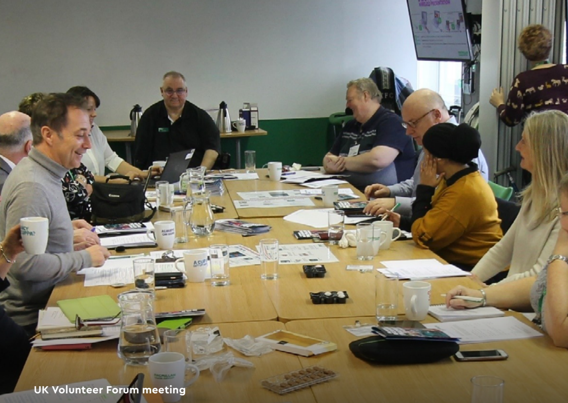
UK Volunteer Forum meeting

There are many different opportunities you can get involved in when you sign up to the Volunteer Voice Network. From using your skills and experiences to help progress a project or initiative you're interested in to raising feedback and suggestions on how the volunteer experience could be improved in your area or role. It's up to you how much you want to get involved, but it's well worth finding out more about it even if you just want to see what's going on.