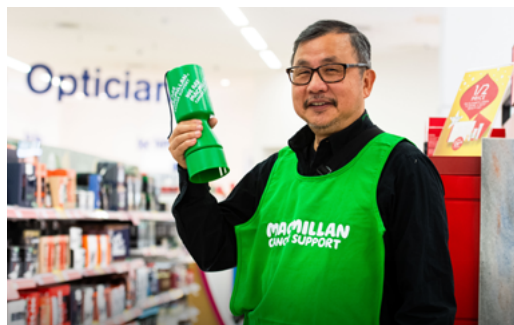
Key, a volunteer collector in London